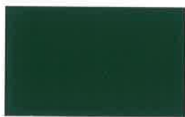
Forest Green (26) CF45 - 29 ga / 26 ga CF40 - 29 ga