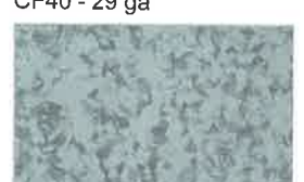
Galvalume® (41) Non-Painted - 25 Year Warranty 29 gauge 26 gauge