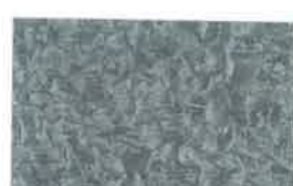
Galvanized (00) Non-Painted Finish - No Warranty 29 gauge