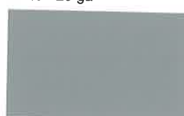
Light Grey (G7) CF45 - 29 ga