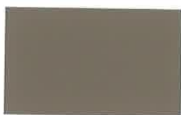
Buckskin (H10) CF45 - 29 ga