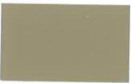
Carlsbad Canyon (10) CF45 - 29 ga