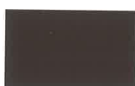
Canadian Brown (B8) CF45 - 29 ga