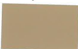
Mocha Tan (22) CF45 - 29 ga CF40 - 29 ga