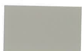
Ash Grey (25) CF45 - 29 ga / 26 ga CF40 - 29 ga