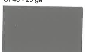
Zinc Grey (29) CF45 - 29 ga CF40 - 29 ga