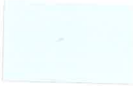
Bright White (39) CF45 - 29 ga / 26 ga CF40 - 29 ga