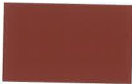
Red (24) CF45 - 29 ga / 26 ga CF40 - 29 ga