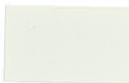
White (30) CF45 - 29 ga CF40 - 29 ga