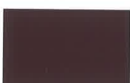
Burgundy (15) CF45 - 29 ga / 26 ga CF40 - 29 ga