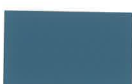
Hawaiian Blue (70) CF45 - 29 ga