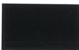
Black (06) CF45 - 29 ga / 26 ga CF40 - 29 ga