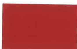
Patriot Red (73) CF45 - 29 ga / 26 ga