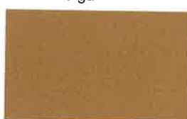
Native Copper (190) CF45 - 29 ga / 26 ga